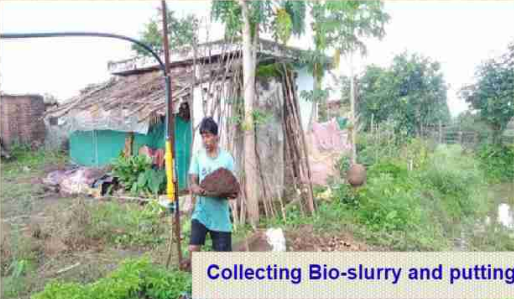
Collecting Bio-slurry and putting into the vegetable garden.