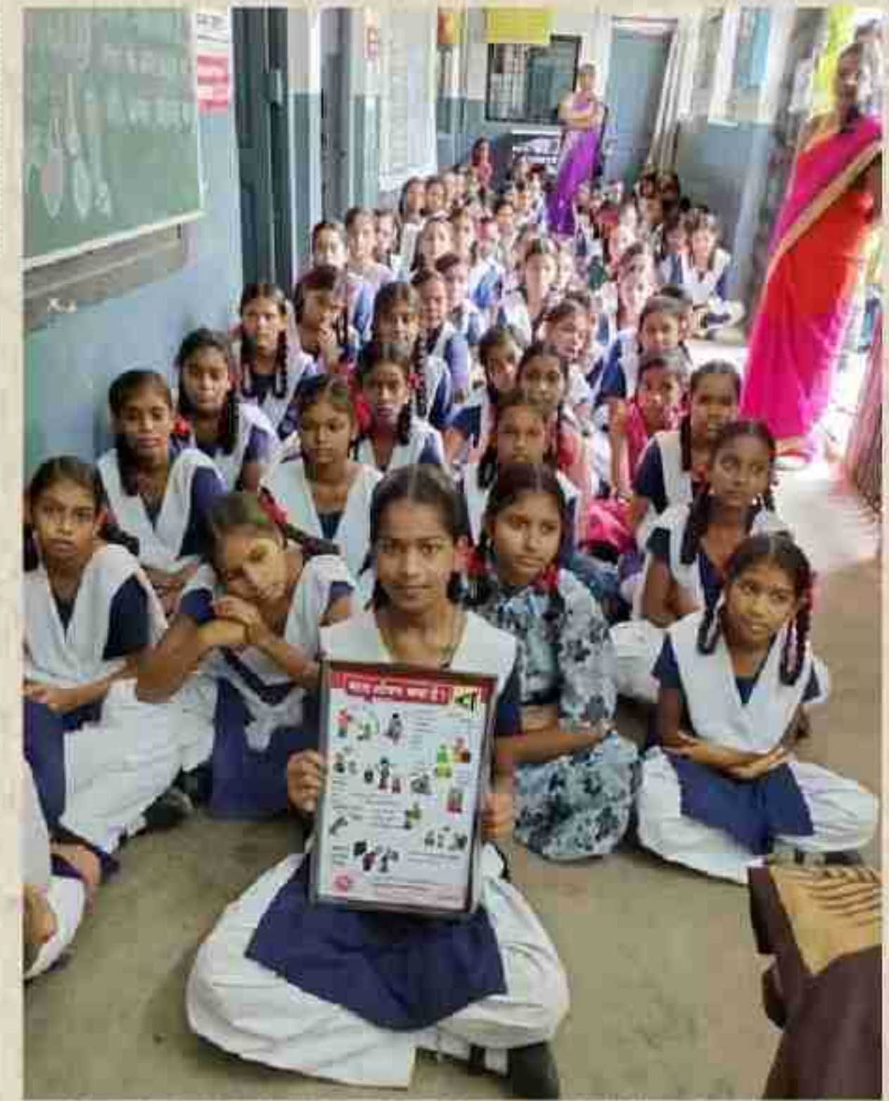
Workshop on Child Sexual Abuse at Saraswati Vidyalay, Nagpur"