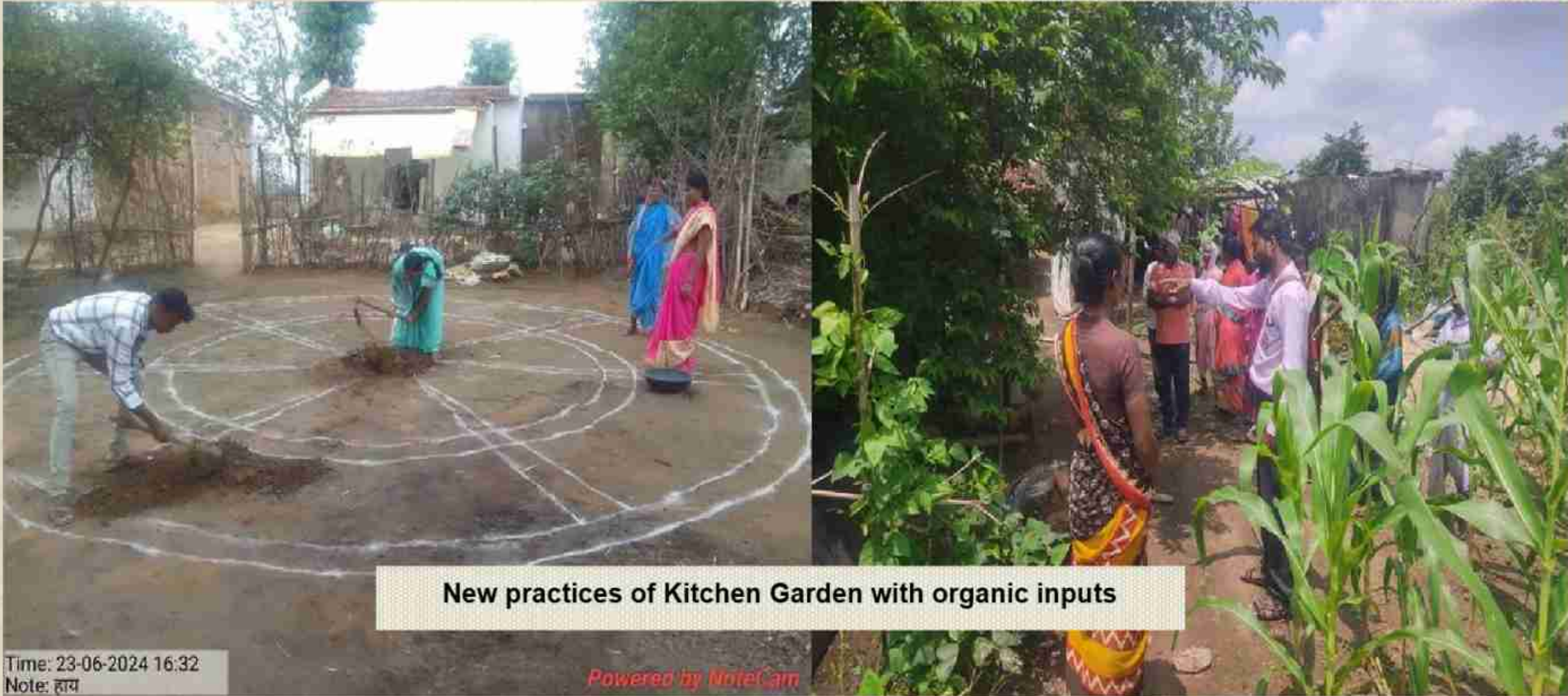
New practices of Kitchen Garden with organic inputs