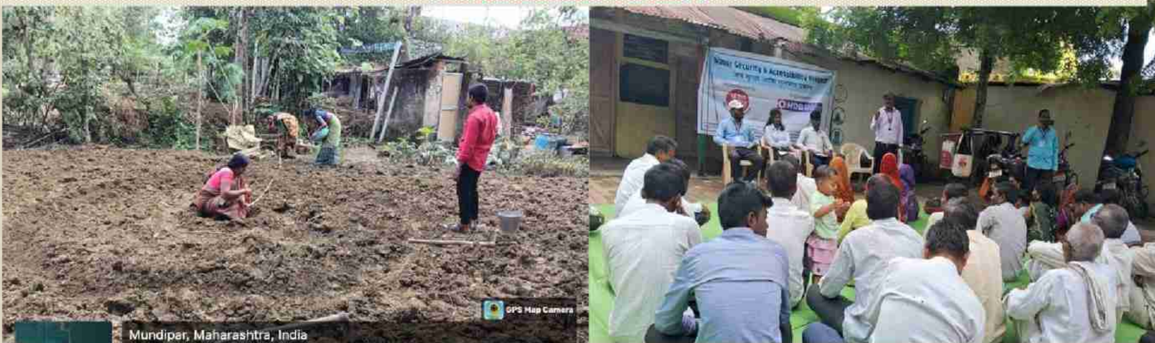
Promoted kitchen gardening