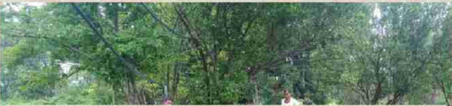
Visited to 361 installed units, 359 are working smoothly.

YRA team ensured frequent visits to the Biogas users to check the present conditions of the bio digesters and recommended the best practices to the families to ensure smooth and efficient use of biogas.