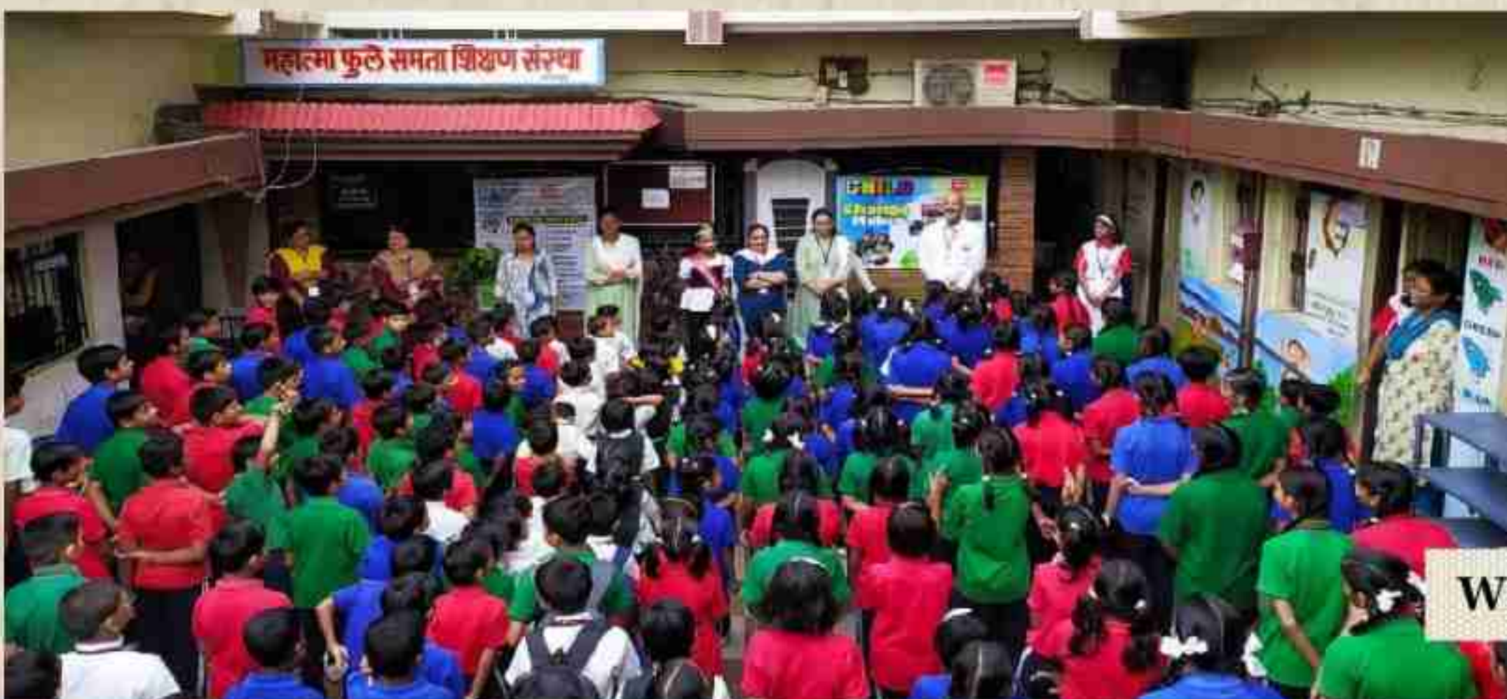
Workshop on Responsibility