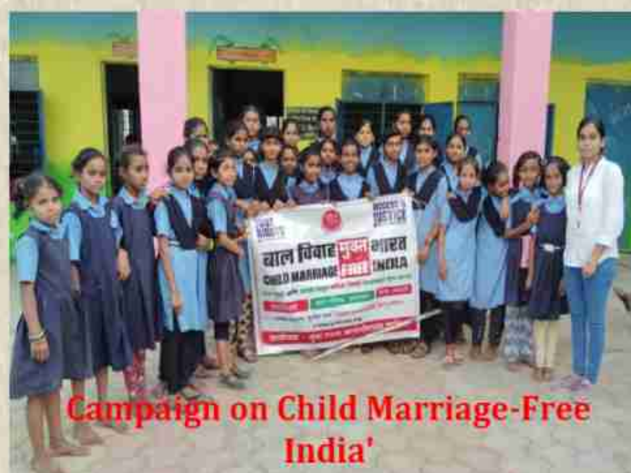
Campaign on Child Marriage-Free India'

One day orientation on child protection laws, trafficking of children, rehabilitative counseling, and leverages technology to combat online trafficking was organized for girls' children of residential school.