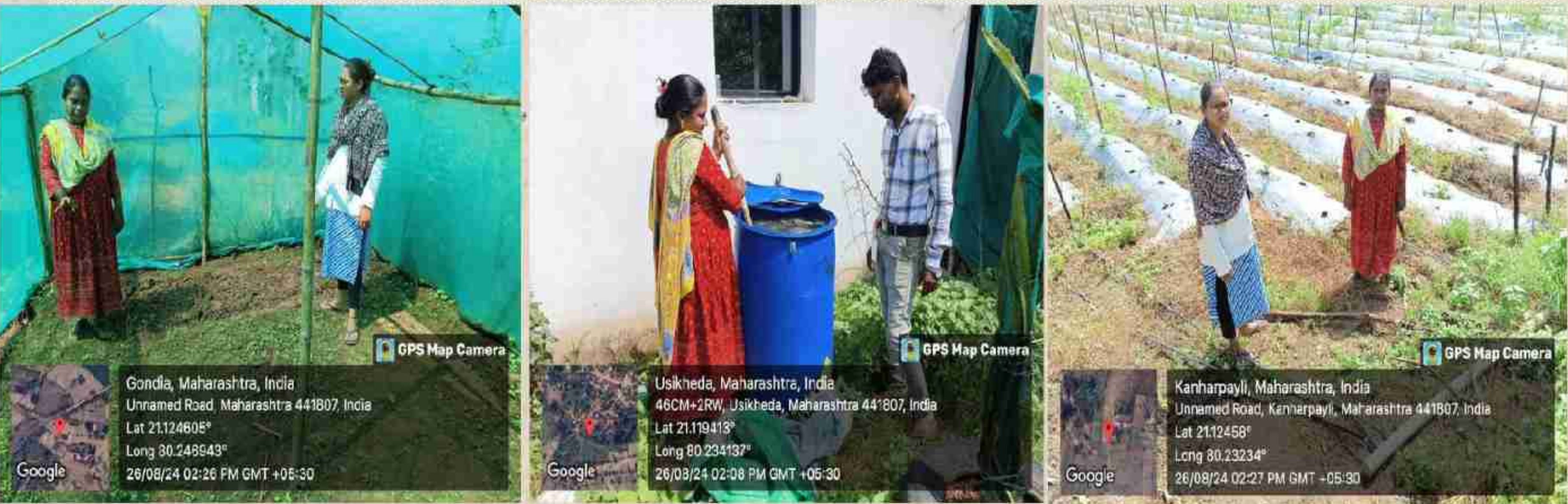
Preparation of organic fertilizers like Dashparni Ark, Nimaste, decomposers, vermicompost, and natural herbicides to promote sustainable farming.

"The YRA supported kitchen gardening and preparation of organic fertilizers like Dashparni Ark, Nimaste, decomposers, vermicompost, and natural herbicides to promote sustainable farming for tribal livelihoods."